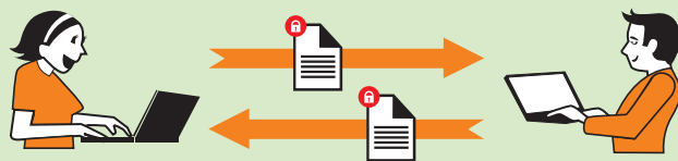
CLOSED FORMAT, IDENTICAL SOFTWARE

Alice uses the software program "Carcera (1) ." She records her report in a closed format (one that does not permit interoperability), then sends it to Bob, who has the same software program. He can read the document, modify it and send it back to Alice.