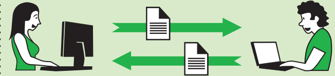
PROGRAMS WITH OPEN FORMATS, DIFFERENT SOFTWARE

The following day, Alice sends her report to Albert. He doesn't have the same software program, which refuses to open the document. Albert has no other choice than to acquire the Carcera software used by Alice, with the hope it is compatible with its computer.