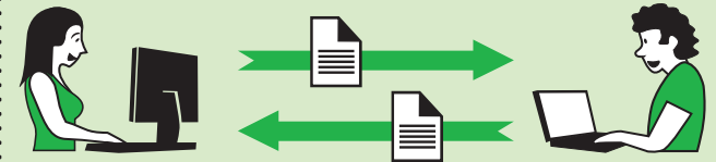
PROGRAMS WITH OPEN FORMATS, DIFFERENT SOFTWARE

The following day, Alice sends her report to Albert. He doesn't have the same software program, which refuses to open the document. Albert has no other choice than to acquire the Carcera software used by Alice, with the hope it is compatible with its computer.