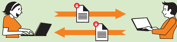
CLOSED FORMAT, IDENTICAL SOFTWARE

Alice uses the software program "Carcera (1) ." She records her report in a closed format (one that does not permit interoperability), then sends it to Bob, who has the same software program. He can read the document, modify it and send it back to Alice.